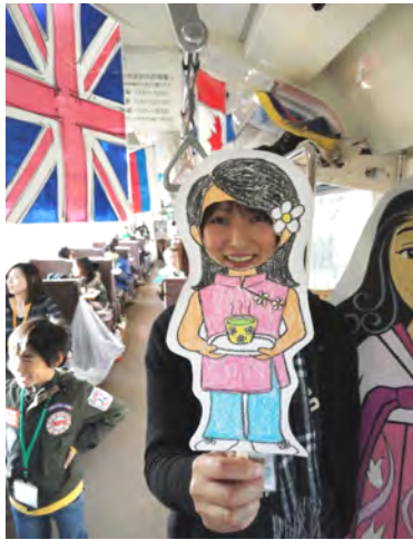
I Am From Vietnam

Aozora Art Project promoted by Aomori Art Museum, Japan