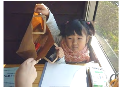
3) Open it! What's inside?