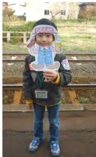
I Am From Germany