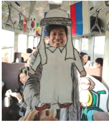
I Am From Saudi Arabia