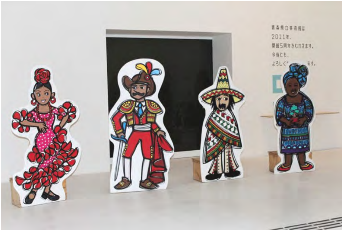
4 Peek-a Boo Boards: Senora, Senor, Nacho, and Ms. Kenya