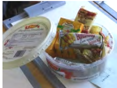
5) Tasting time!

Can you imagine people from foreign countries from the taste of the candy, color, package or shape?