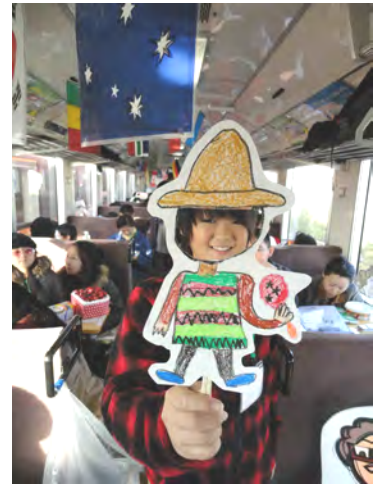
I Am From Mexico