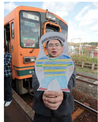
I Am From Germany.