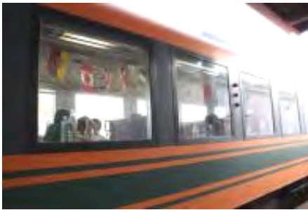
1) Chartered train

I gathered from New York rare sweets originating in various countries around the world. (28 countries) Tasting the flavors of an unknown country, participants created the letter-sized mini Peek-a Boo Boards and transform into a foreigner and take commemorative photographs. The photographs are made into a special album as a memory of the trip and given as a present at the workshop.