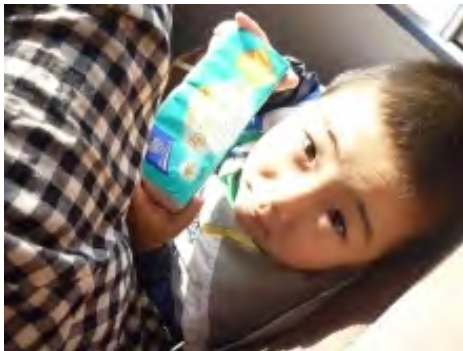
4) The sweets were passed out in bags, and the passengers were not told which country they came from.