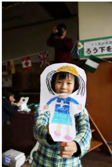
I Am From Greece.