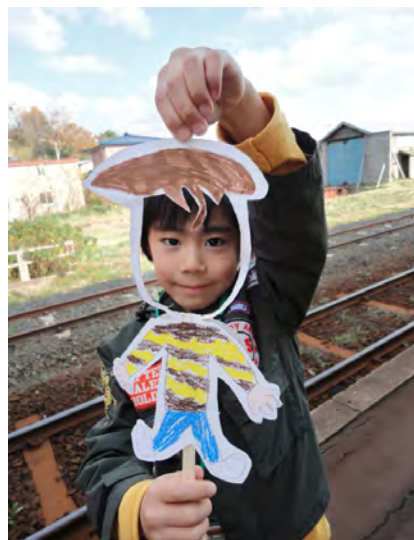
I Am From Korea.