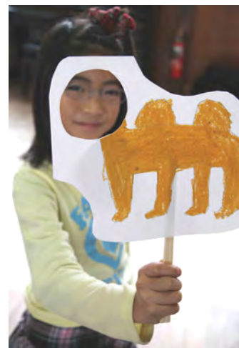
I Am From Libya