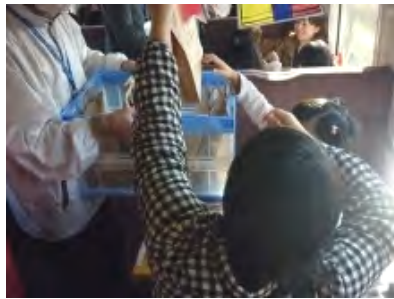
2) Choose a bag!