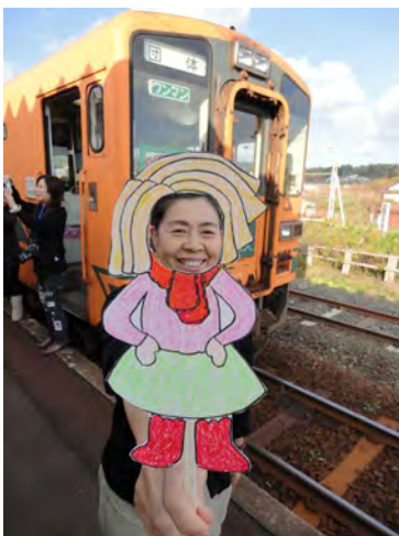
I Am From Poland